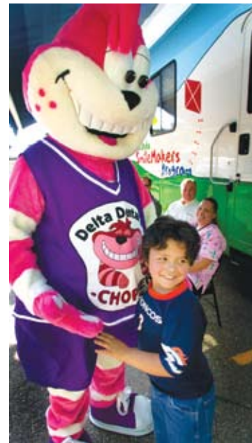
Smile-a-Bration mascot Chopper shares warm hugs with Colorado children.