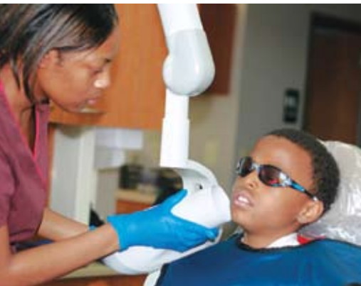
Waukesha County Community Dental Clinic is one of several clinics across Wisconsin that are able to provide diagnostic and restorative services to low-income patients as a result of financial support from Delta Dental of Wisconsin.